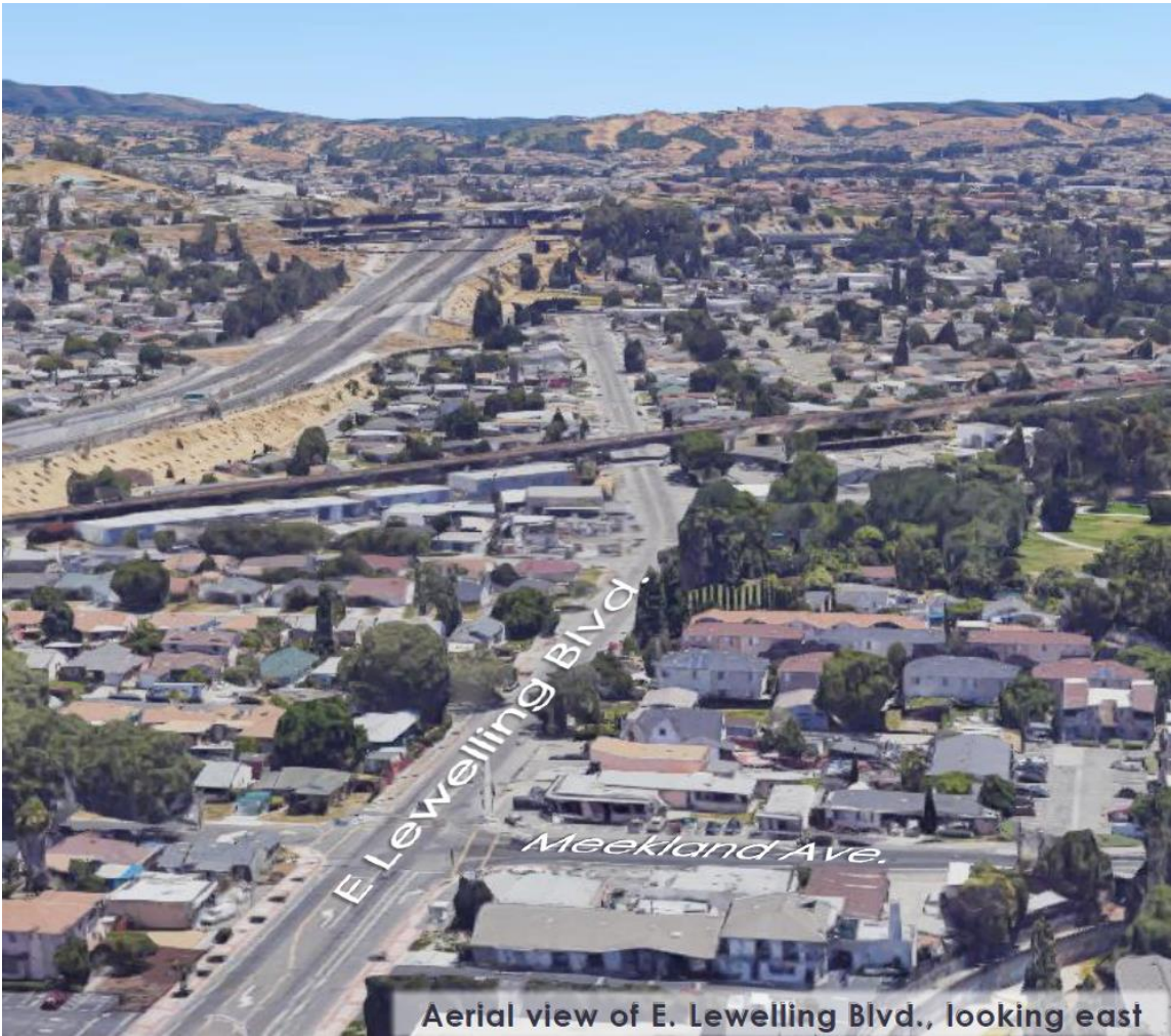
Aerial view of E. Lewelling Blvd., looking east